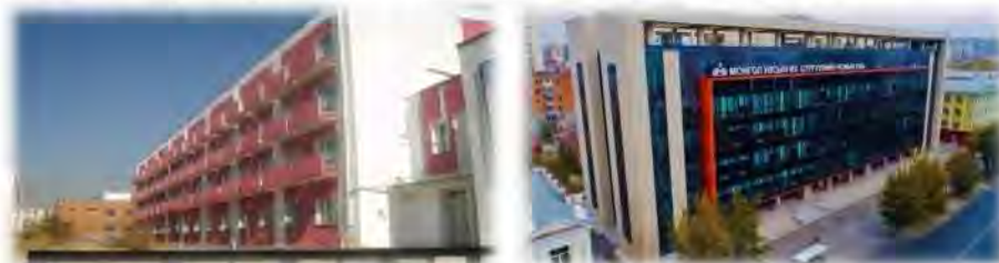
Students’ dormitory and NUM library

In the city, foreign students will stay in student hostel of the National University of Mongolia. Mongolian students will stay in their home. In the field, students must be prepared to live and work in a field camp, sleep in tents, share camp chores and maintenance, and engage in strenuous outdoor activities such as hiking to field work. Professors and staffs will stay at a hotel that the organizing committee recommended, or they booked themselves.