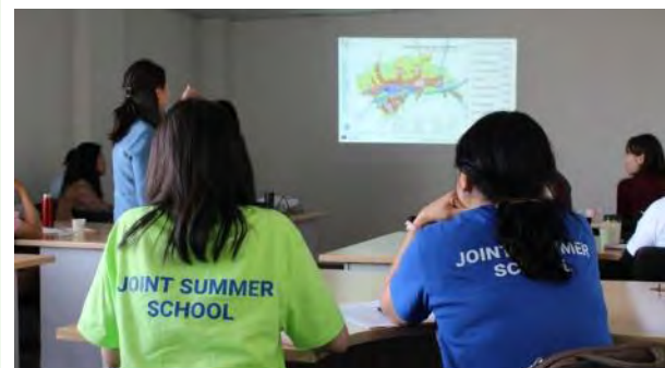
A horizontal stand, presentation templates, and T-shirts