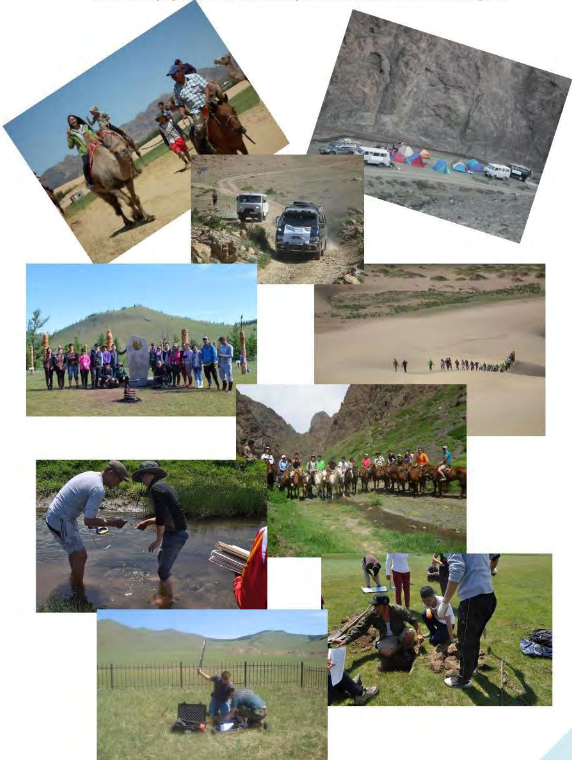
Summer school program for urban resilience, adaptation and sustainable environmental management